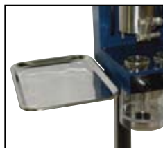
Side Tray #910-7796A