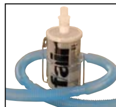
F/Air Scavenging Kit #580-1250A