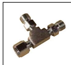
Oxygen Inlet TEE #910-125